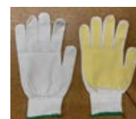
CUT RESISTANT GLOVES - GANTSPRO