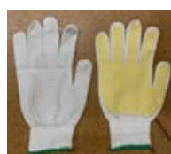
CUT RESISTANT GLOVES - GANTSPRO