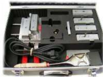
OVERLAP Tool Case

Includes : M150, J150, 1 pair of dies, S135 cutting clamp.